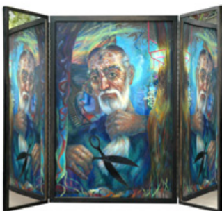
Itinerant Librarian's Dilemma of Choice and Refusal