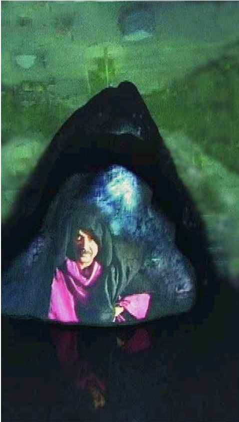
installation still Liminal Zones, Apeejay Media Gallery, Delhi Nov 16 - 17 2003 MAN IN WATER 2003 2 channel video, 13 minutes loop with sound

sound of children playing and laughing. The man roars like a lion and turns into gold, so does the mound and so does the water and we hear the sound of a sufi singing and the day begins anew with traffic emerging. It was very complex with real water and videoed water.