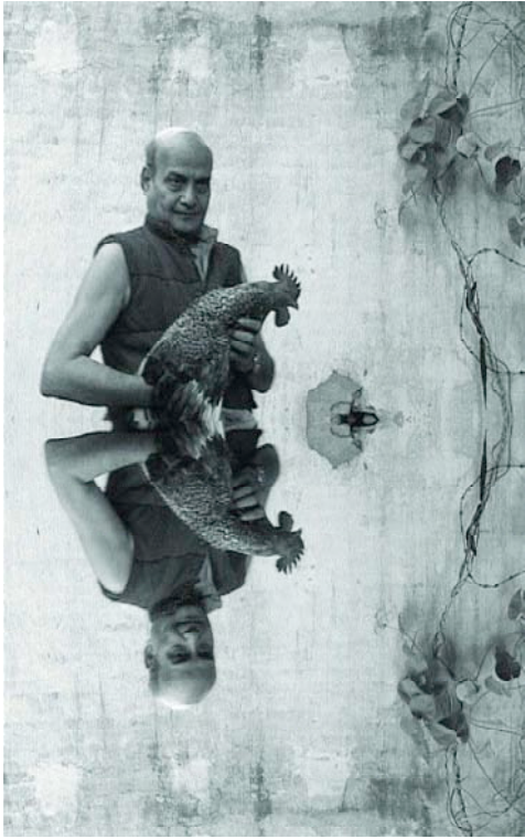
MAN WITH COCKEREL 2001-02 2 channel video, 19 minute loop

station I was told that some villagers thought it was possessed. There was a builder close by and from time to time he would get some of the workers in his jeep and push them into the room. They were apparently frightened by this possessed mirror.